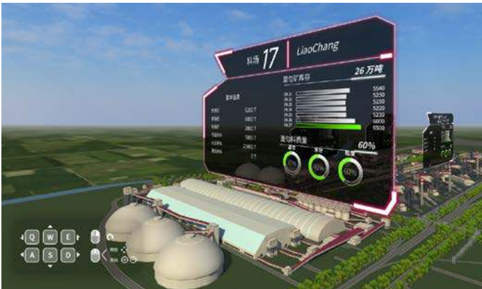
Using SYNCHRO 4D optimized plant layout and significantly reduced the construction cycle, reducing by 75%.

Using ContextCapture, they processed oblique photography to generate an accurate reality mesh of the entire site. With SYNCHRO 4D, they conducted construction simulation to visualize and achieve the precise plant layout and equipment installation within the limited space. Lastly, by integrating AssetWise® ALIM, MCC developed an engineering database to incorporate all asset information, design, procurement, manufacturing, construction, and installation data, laying the foundation for a digital factory deliverable.