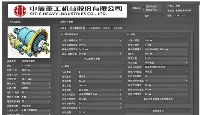
Using Bentley applications, Citic created a digital construction management system, reducing construction time by 7%.

operations. This process facilitated online, intelligent equipment monitoring and diagnostic services, establishing a preventive maintenance system that enhanced operational safety and improved equipment reliability. Through Bentley's integrated, cloud-based applications, Citic produced accurate 3D models of the entire main equipment and can now digitally monitor plant equipment and processes, achieving whole lifecycle BIM management from design through delivery and operations.