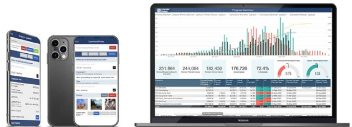
Link physical progress against construction schedule items to compare actual start and finish versions of the construction plan.

SYNCHRO Perform leverages mobile and web-based technology so you can make project information available to all relevant team members, based on defined authority levels, mobilizing the power of your entire workforce. SYNCHRO Perform supports major mobile and web platforms and enables diverse work practices and collaboration, from field teams, to design and construct offices, to clients and subcontractors.