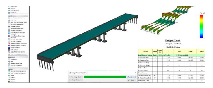
Create multiple design alternatives with different analytical methods to optimize your bridge design.

Modeling in a 3D environment helps rapidly verify bridge geometry. The bridge is seen in plan, elevation, and cross-section views. A variety of deliverables can be generated using OpenBridge Designer. It also facilitates the evaluation of multiple bridge alternatives, construction sequences and costs reports, and well-organized analysis and design reports. You can utilize iTwin® Design Review workflows for 2D and 3D design review in a web-based environment that streamlines review sessions on design work-in-progress deliverables. OpenBridge Designer, with its seamless interoperability with ProStructures, can be used for concrete detailing. OpenBridge Designer also offers a companion installation of LumenRT™ to create stunning visualizations.