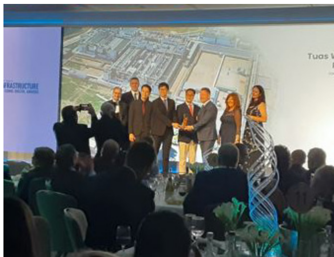
The winning team of Jacobs and PUB accepting their award.

Leveraging OpenFlows WaterSight and 3D Structural Analysis And Design Software (STAAD) from Bentley, L&T modeled and analyzed multiple hydraulic operating scenarios to ensure that the sewer and water network is optimized and performed structural design and analysis for 125 different structures. The integrated technology solution saved 40% in engineering resource