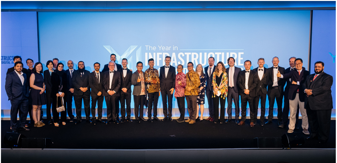
2022 Going Digital Awards in Infrastructure winners