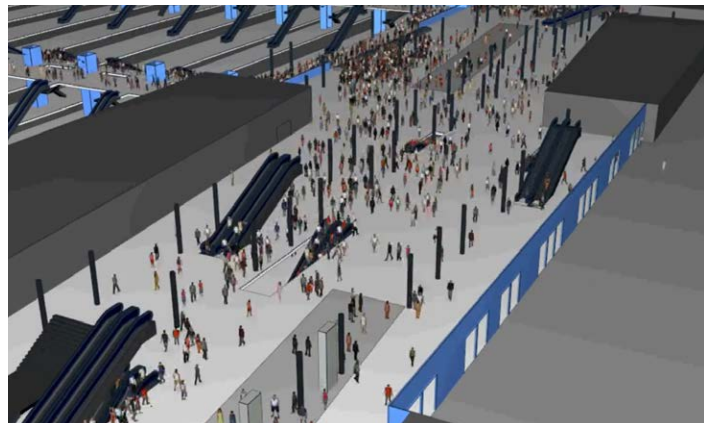
The passenger simulation informed the station's final configuration, ensuring smooth operations during peak volume.

By optimizing passenger movement during the building's design and configuration phases, the project team anticipates that the new Gare du Nord will accommodate growing pedestrian traffic for several decades. Future-proofing the station will prevent the project owner from undertaking expensive changes in station design sooner than anticipated. Additionally, making shops as attractive and accessible as possible is expected to increase their revenue.