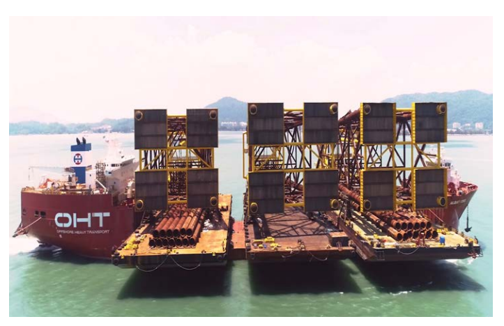
The team lowered transportation costs by 40% through the use of a single semisubmersible heavy-lift vessel instead of multiple tugboats.

The successful delivery and installation of the WHP jackets set a new benchmark for Sapura Energy and NOC. The project demonstrated the effectiveness of using a semi-submersible heavy-lift vessel for transporting large offshore structures. This innovative approach has enhanced Sapura Energy's reputation and highlighted their capability to undertake similar projects in the future. "The successful use of MOSES software to simulate the selected vessel's adequacy and expected behavior while transporting large and risky cargo within allowed tolerances gave us the ability to deliver projects that make possibilities a reality," said Billah. "This achievement paves the way for many more future projects, opening paths to even more innovations in the region."