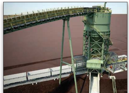
This image shows Brockman Syncline No. 4 Project-Rendering with ProSteel structural members.

The project was primarily modeled in Bentley's ProSteel software. The software is ideally suited to tasks such as laying out complex structures, producing shop drawings, assembling all connections, and managing bills of material. ProSteel increases productivity by providing the automatic creation of documentation and details. PDC used the software to model