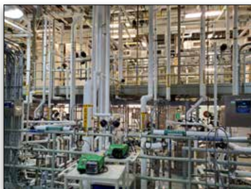
DPR needed to place more than 7,000 linear feet of stainless-steel piping all within a tight footprint.

The project was complicated, requiring over 7,000 linear feet of stainless-steel piping, 11 miles of new power and data cabling, and over 40 tons of steel platform work, all needing to fit within the facility footprint. The scope of work also mandated additional filtration equipment and larger material vessels, resulting in the removal of 24 vessels and seven existing skids to make space for larger vessels and new skids. These updates were implemented to increase production of the potentially life-changing drug, as well as help manufacture other drugs for partners.