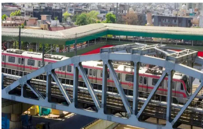
The Punjabi Bagh Metro Interchange in Delhi, India, connects the Delhi Metro's Green and Pink lines, enhancing passenger travel experience.