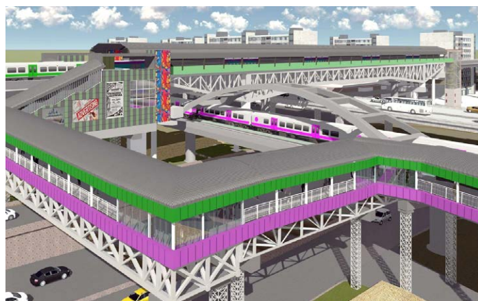
Using OpenBridge, STAAD, and RAM enabled coordinated design and clash detection, improving efficiencies by 20% and saving INR 8 million.